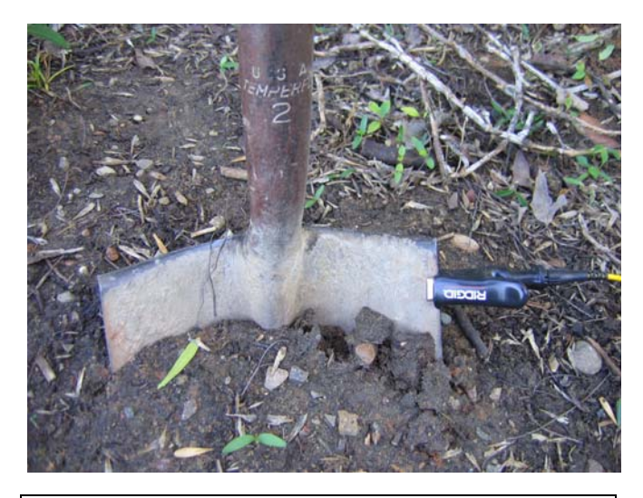
Like the antenna on a car, exposing more metal captures more signal.